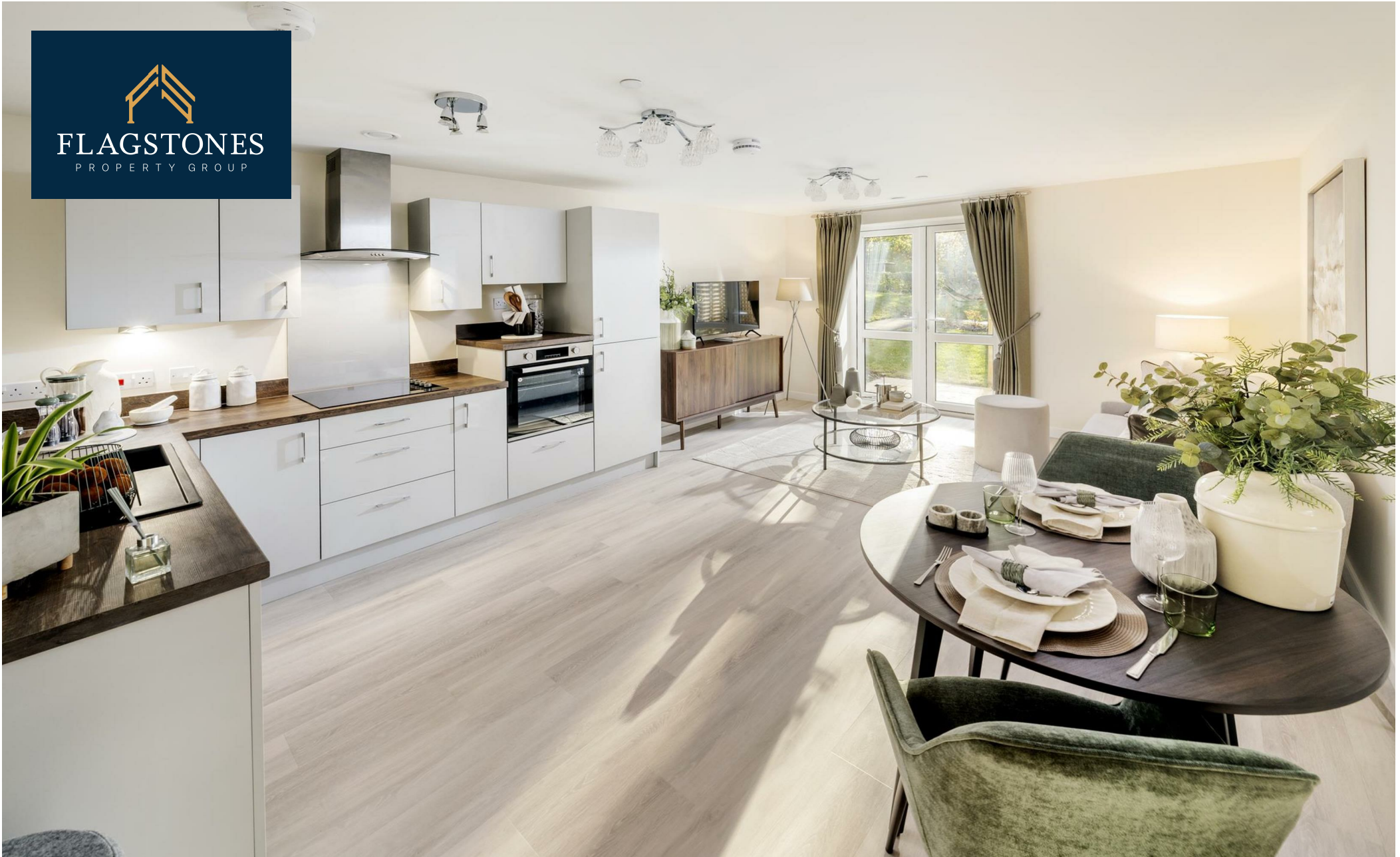
Apartment 35, 85 Coare Street, Macclesfield, SK10 1HZ £219,950