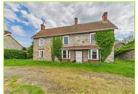
Blackmoor Farm, Blackmoor, Langford, North Somerset, BS40 5HJ