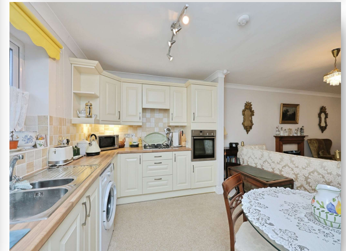
Lilac Mews, Swanton Morley, Dereham, NR20 4FL