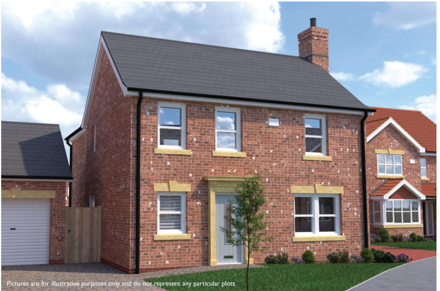
Pictures are for illustrative purposes only and do not represent any particular plots