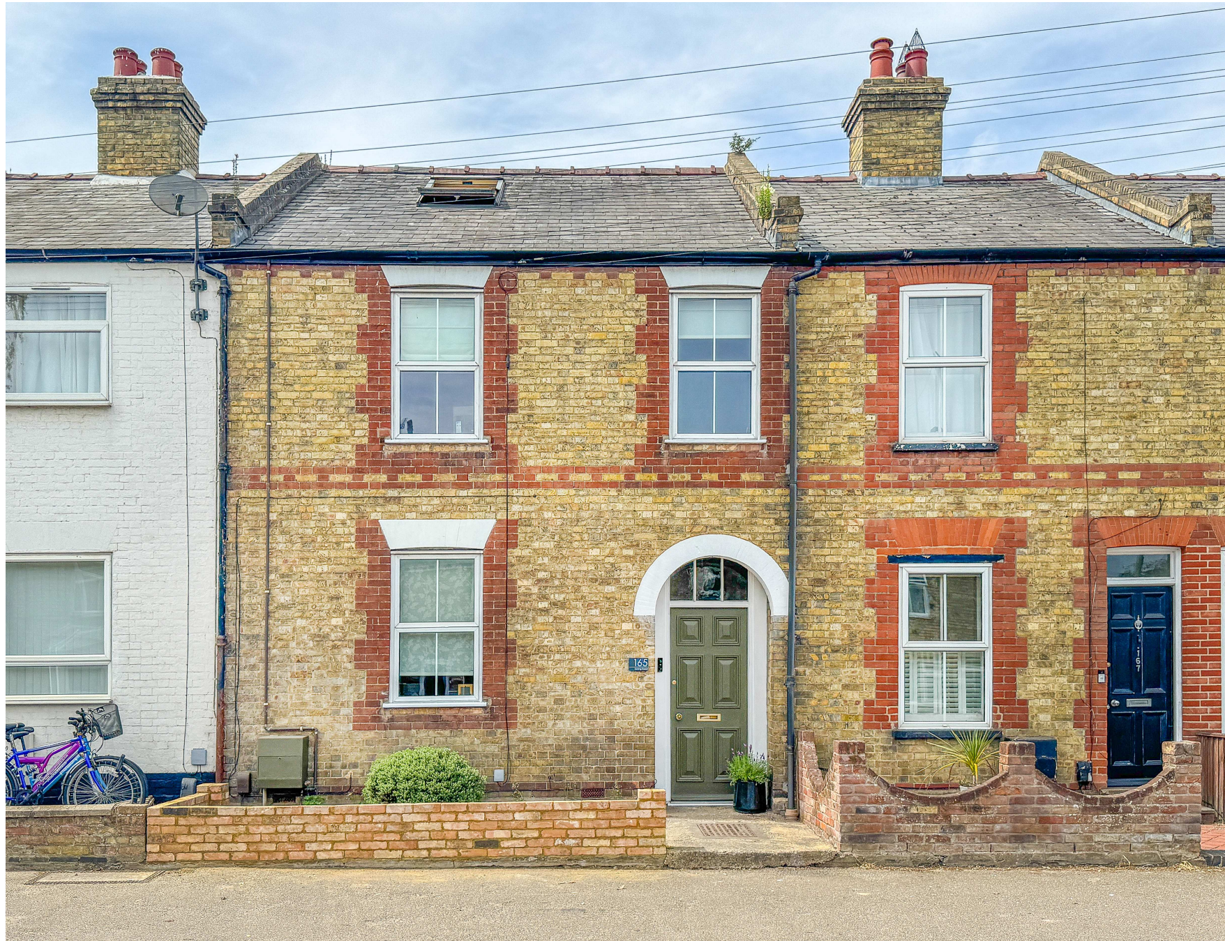
Exning Road, Newmarket, Suffolk