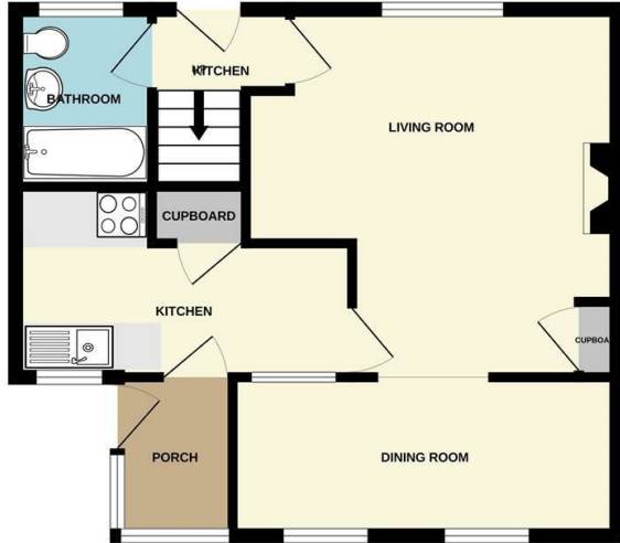
GROUND FLOOR 457 sq.ft. (42.5 sq.m.) approx.