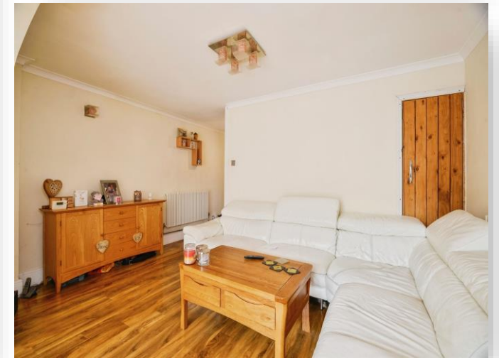
Parkfield Way, Stockton-On-Tees TS18 3SU