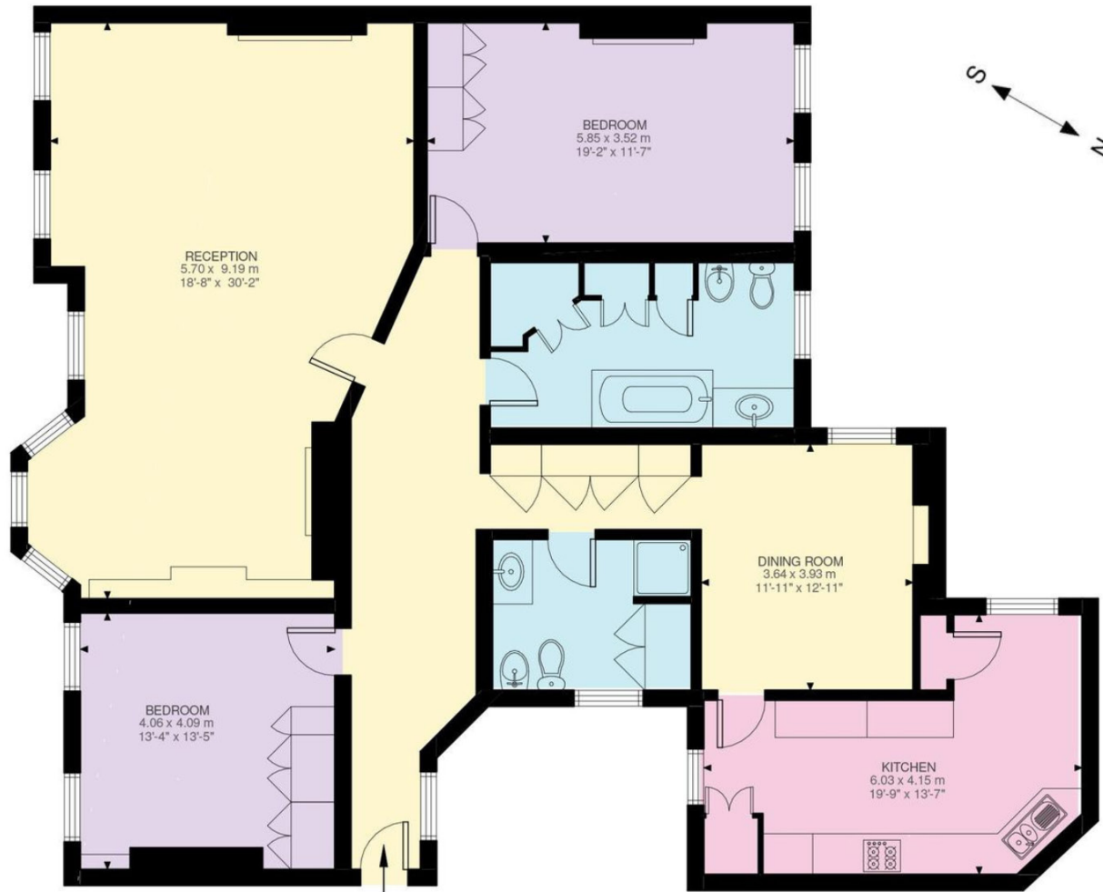
Second Floor 1842 ft 2

Old Brompton Road, SW5 Approximate Gross Internal Area = 171.1 sq m / 1,842 sq ft