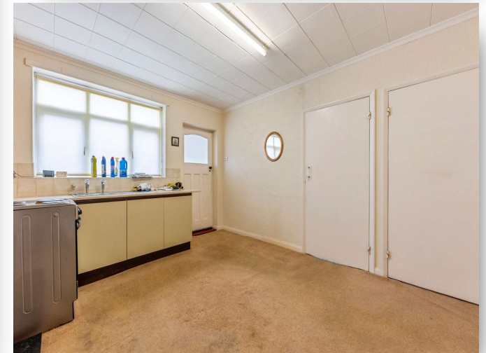
Hawton Road, Newark NG24 4QE