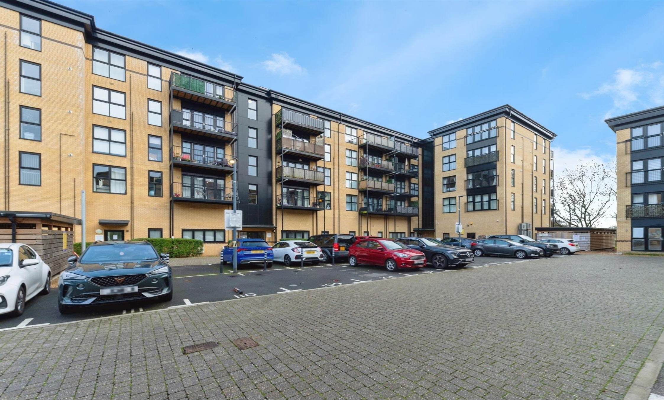
Chilton House Giles Crescent, Stevenage SG1 4FQ