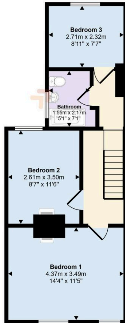
First Floor Approx 44 sq m / 471 sq ft

This floorplan is only for illustrative purposes and is not to scale. Measurements of rooms, doors, windows, and any items are approximate and no responsibility is taken for any error, omission or mis-statement. Icons of items such as bathroom suites are representations only and may not look like the real items. Made with Made Snappy 360.