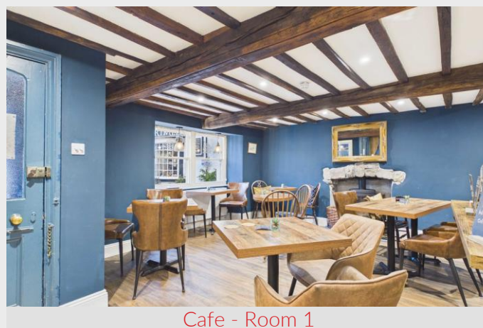
Cafe - Room 1