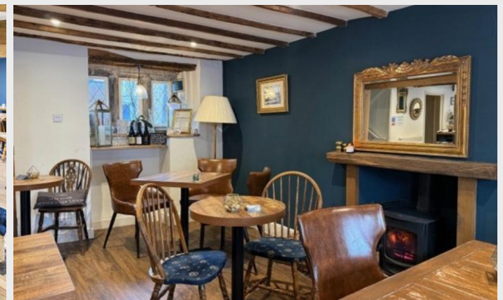
Cafe - Room 2