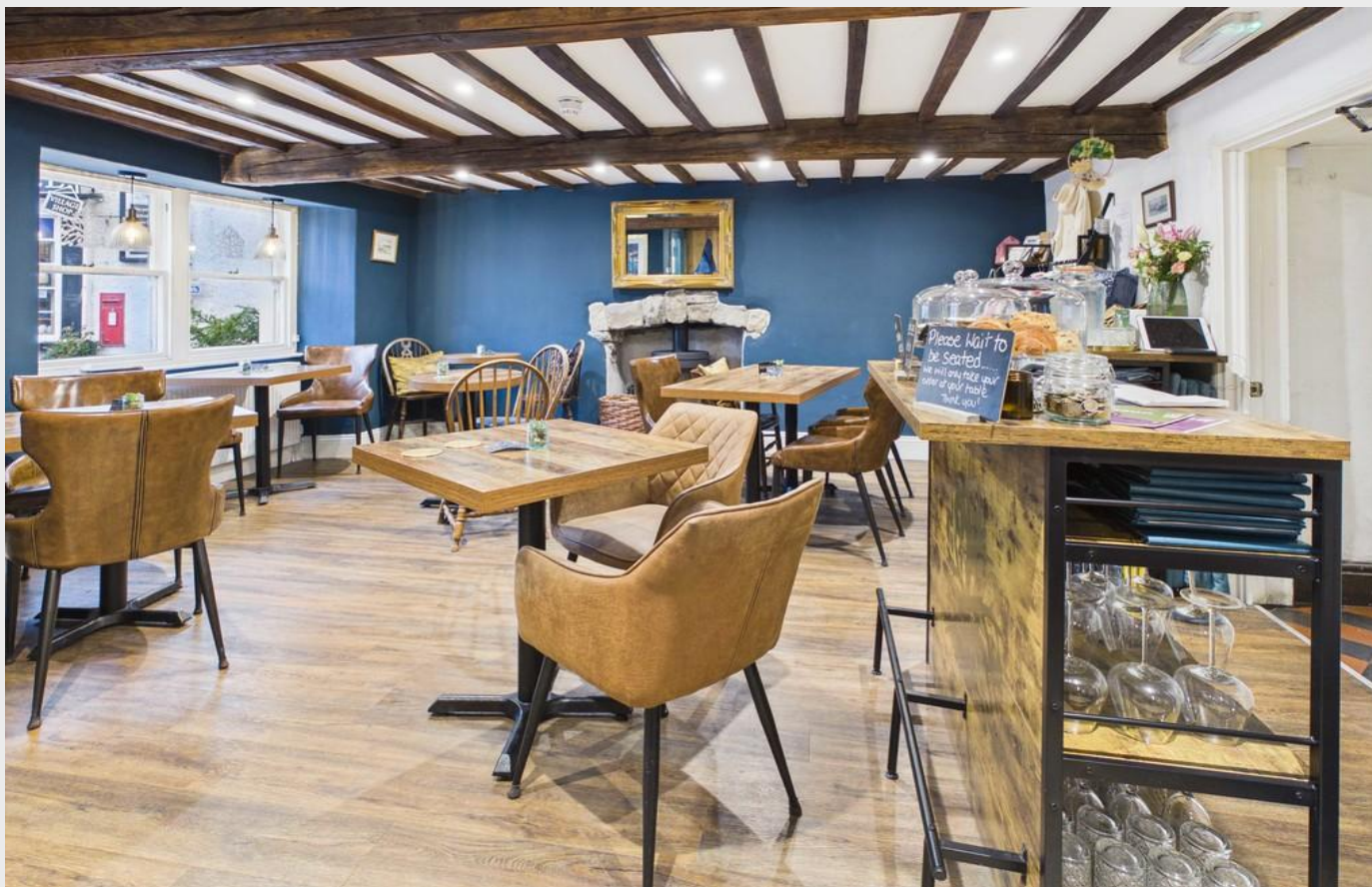
Cafe - Room 1