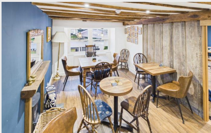
Cafe - Room 2