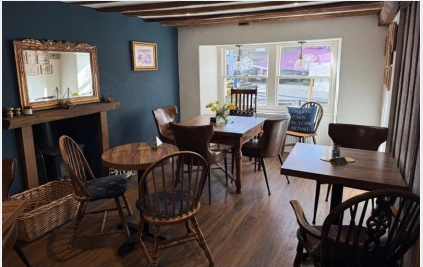
Cafe - Room 2

The second stair from the Half Landing leads to the First Floor Landing which has 2 storage cupboards, Ladies and Gents WC, Office, Fire Exit and stairs to the Second Floor. The Gents WC has a WC and vanity wash hand basin, part tiled walls, engineered 'Oak' floor and extractor fan. The Ladies WC has ample space for baby changing facilities together with a WC and vanity wash hand basin. Part pitched ceiling with roof light, feature leaded window, engineered 'Oak' floor, part tiled walls and extractor fan. The large Store Room speaks for itself, but could be an ideal Office with sash window.