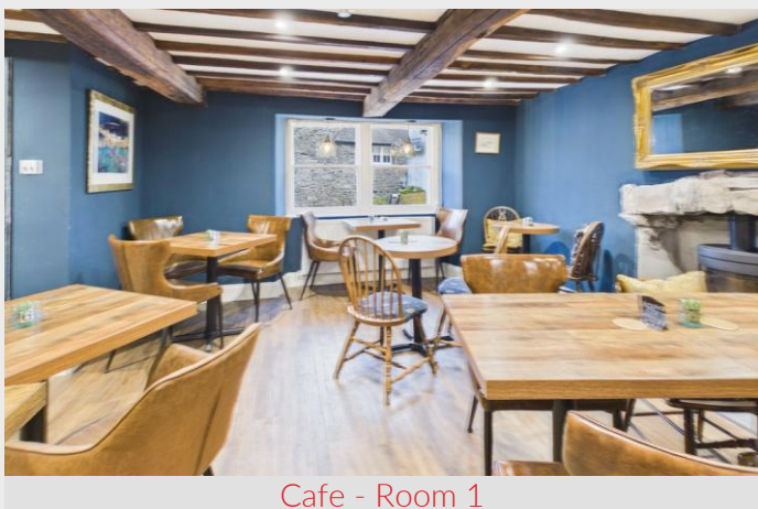
Cafe - Room 1