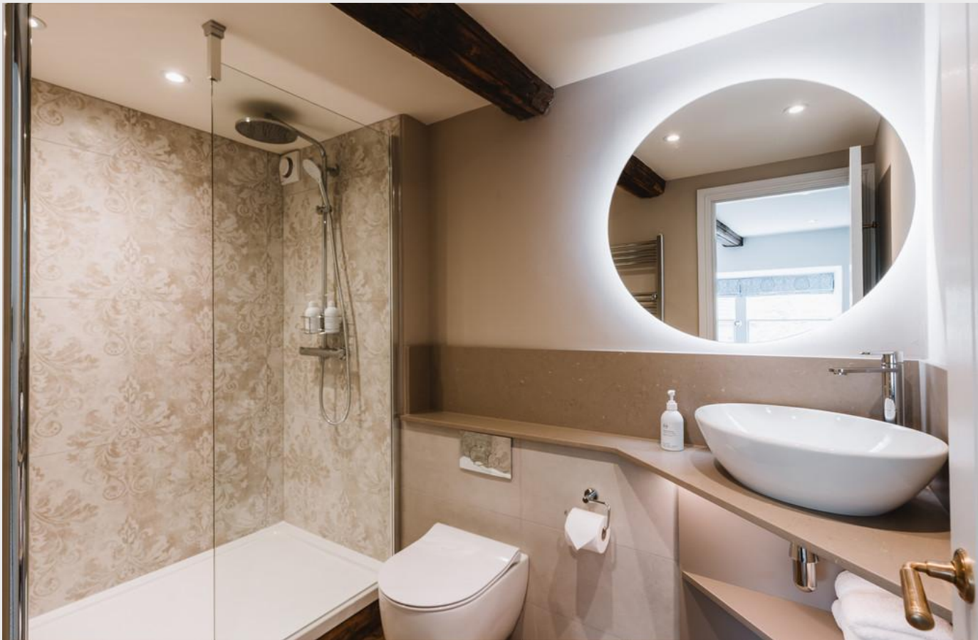
Bedroom 1 En-Suite Shower Room

Available 'ready to go' with all contents included (apart from some personal effects).