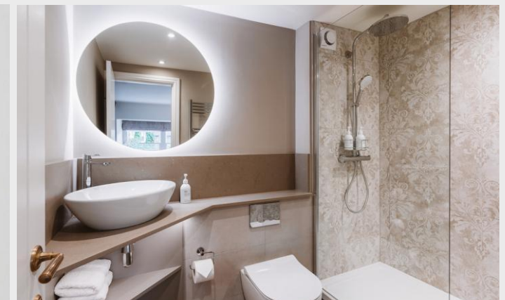
Bedroom 2 En-Suite Shower Room