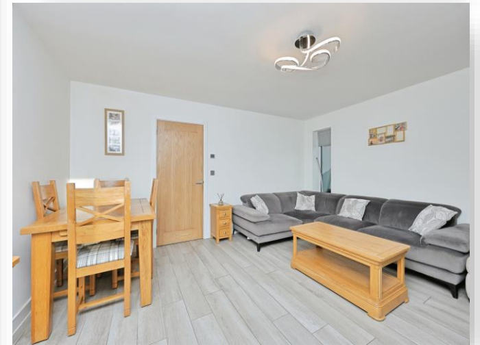
Texel Road, Watton Thetford IP25 6YS