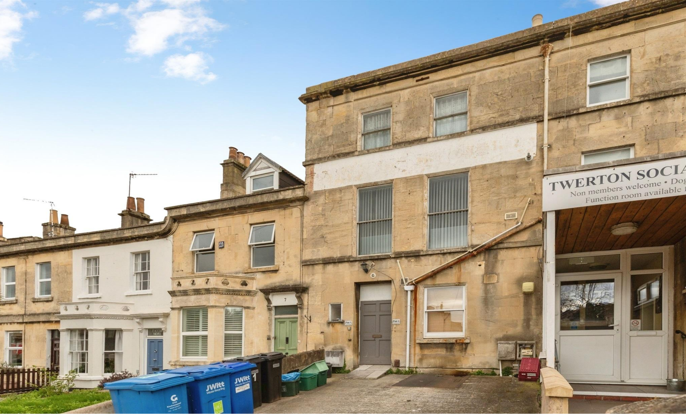
Flat 2 Victoria Buildings, Bath BA2 3EH