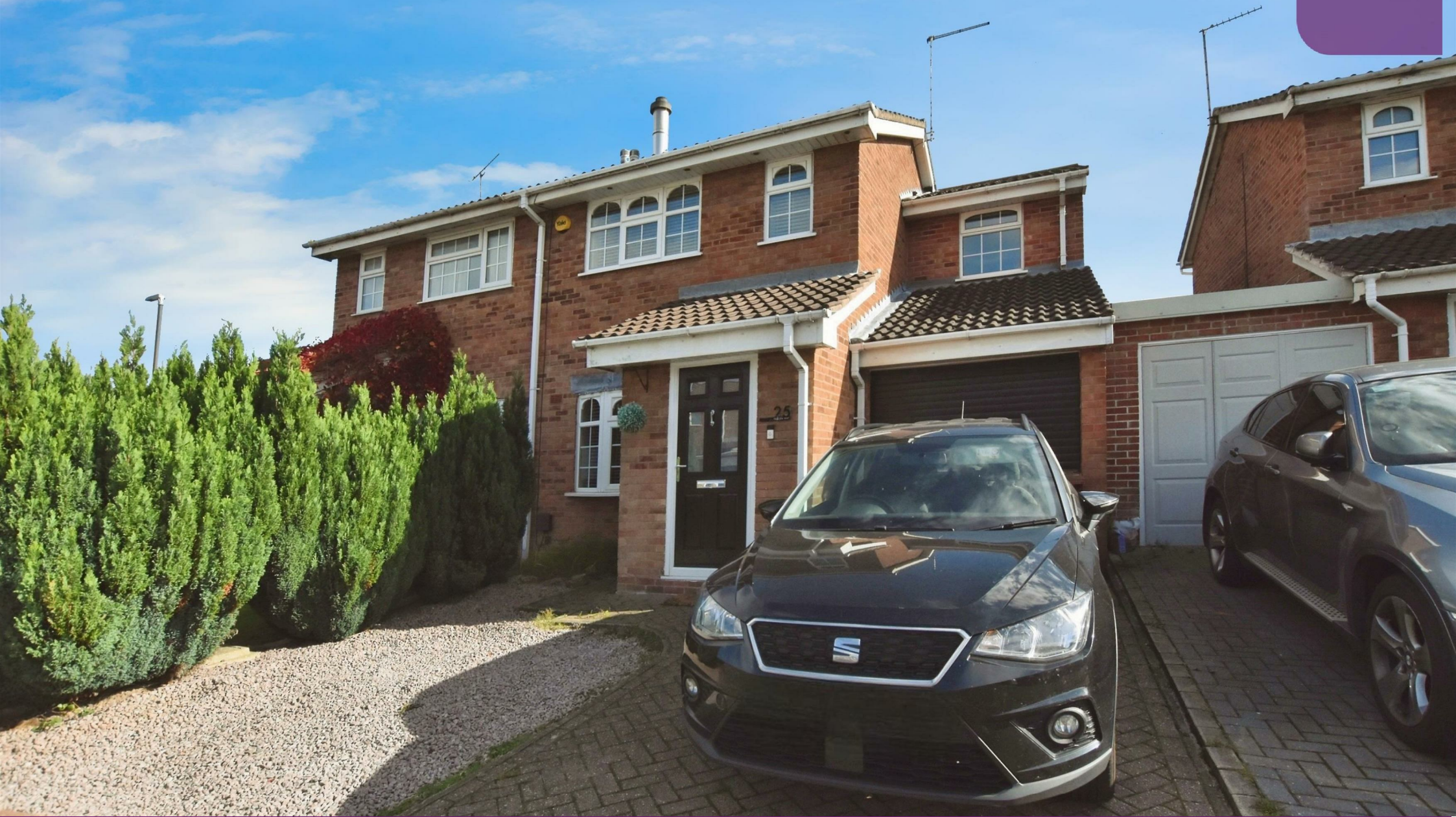
25 Falcon Way, Woodville, Swadlincote, DE11 7QS £199,950