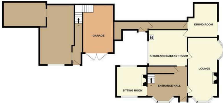
GROUND FLOOR 1578 sq.ft. (146.6 sq.m.) approx.