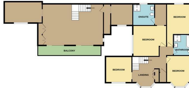
1ST FLOOR 1885 sq.ft. (173.6 sq.m.) approx.