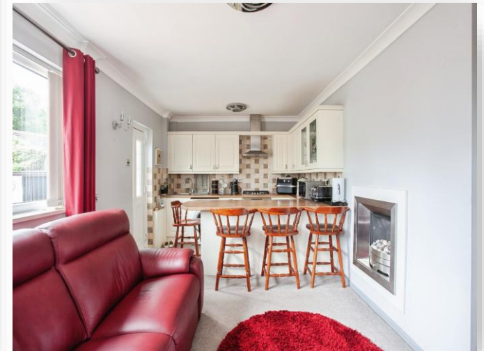
Lindley Crescent, Thurnscoe Rotherham S63 0SW