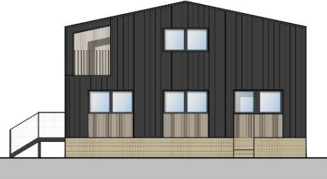
2. Proposed Side Elevation 1:100 @ A2