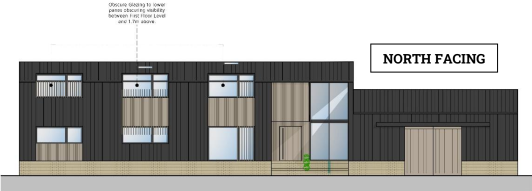
1. Proposed Rear Elevation 1:100 @ A2