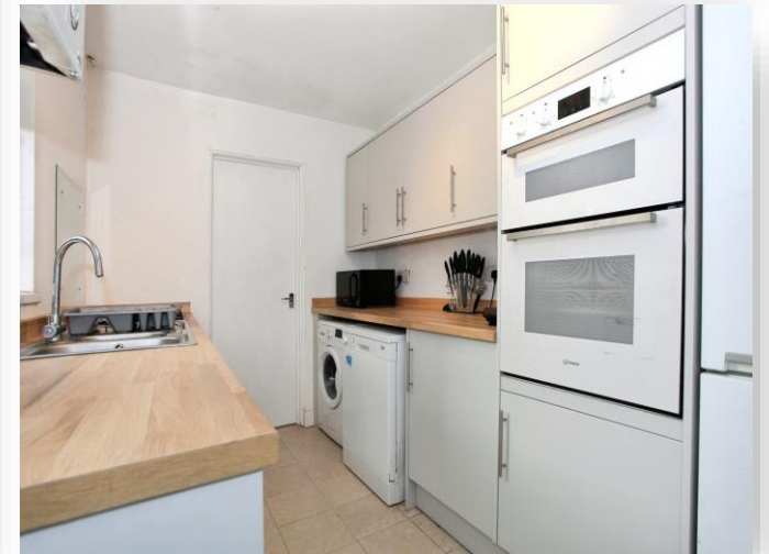
Duke Street, Peterborough PE2 8EB