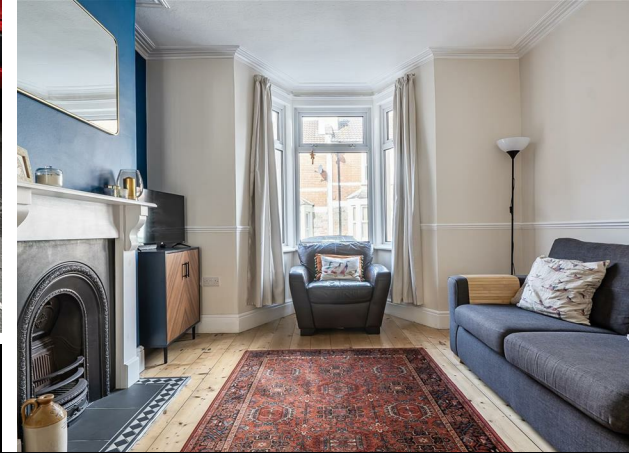
7 Ryde Road, Bristol, BS4 2ES