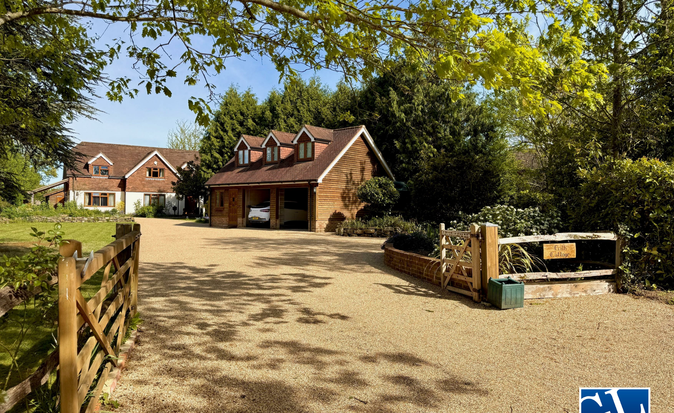
Frith Cottage, Stall House Lane, Pulborough, West Sussex RH20 2HR