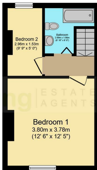
First Floor Floor area 26.1 sq.m. (280 sq.ft.)

Total floor area: 52.1 sq.m. (561 sq.ft.)