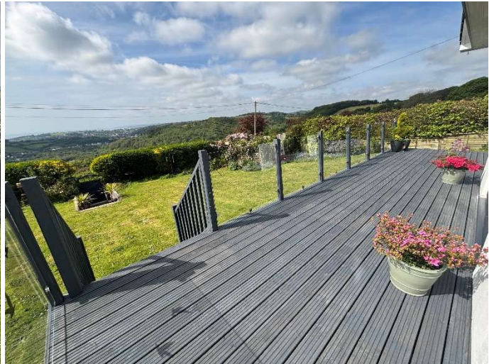
SOUTH FACING GARDEN AND DECKED TERRACE WITH SEA VIEWS