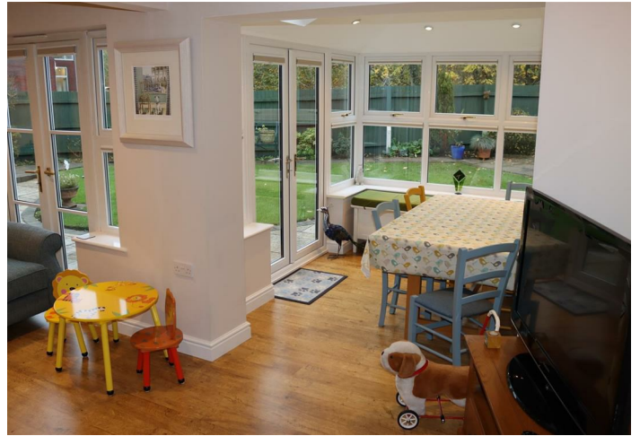
Superb Dining/Kitchen/Family Room