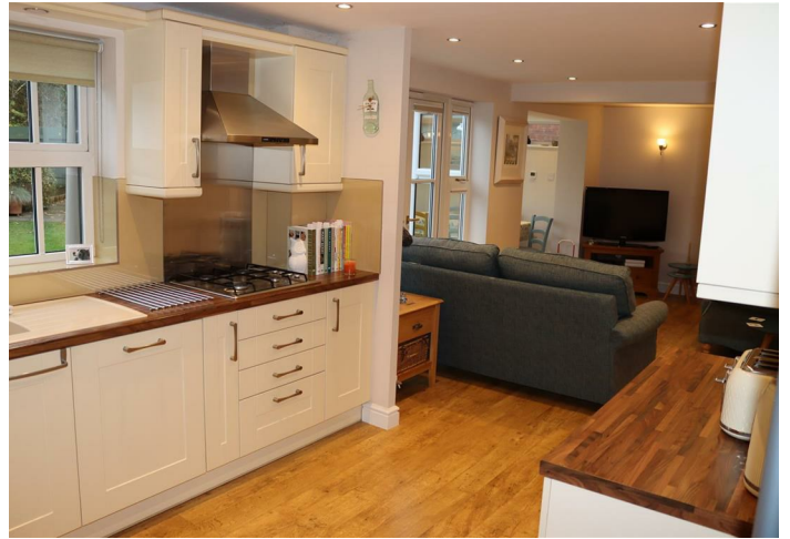
Superb Dining/Kitchen/Family Room