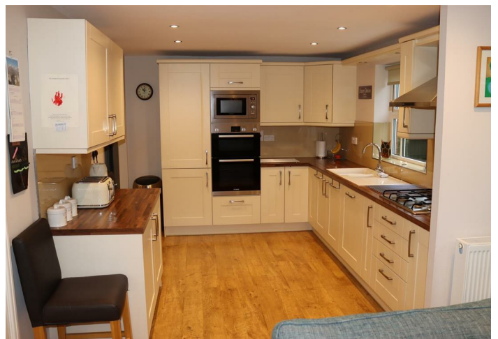
Superb Dining/Kitchen/Family Room