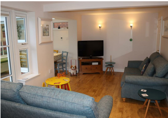
Superb Dining/Kitchen/Family Room