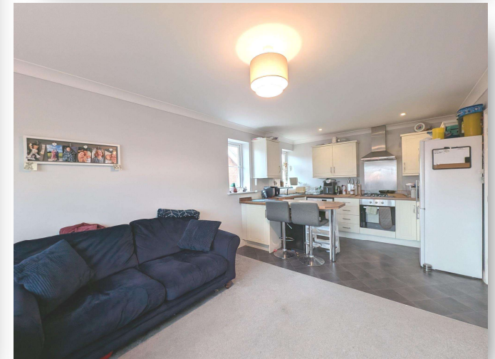
Treeview, STOWMARKET, IP14 1SS