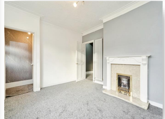
Thornbury Crescent, Bradford BD3 8HB