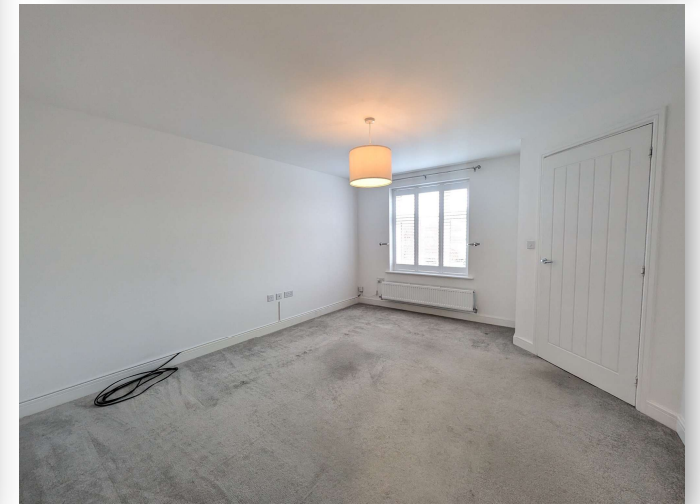
Tynan Crescent, Stowmarket, IP14 1WB