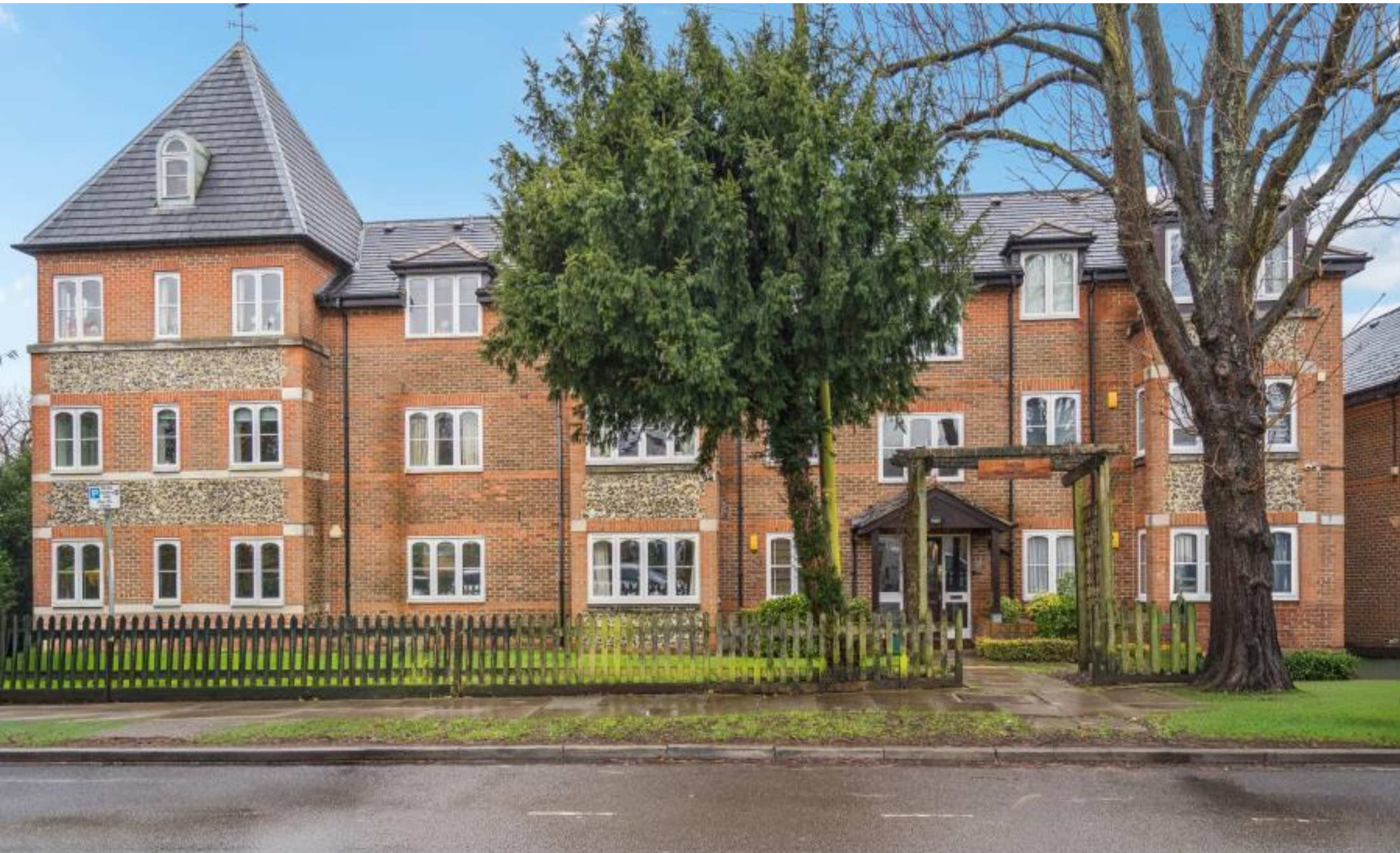
A two bedroom ground floor apartment in a sought after location Chestnut Court, Northwood, HA6 3NN