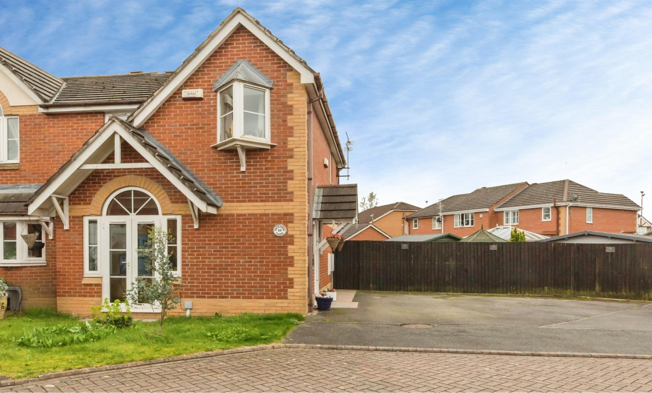
Thornton Close, Winsford CW7 3RR