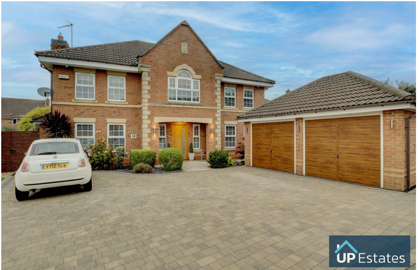
Broadsword Way, Burbage, Hinckley