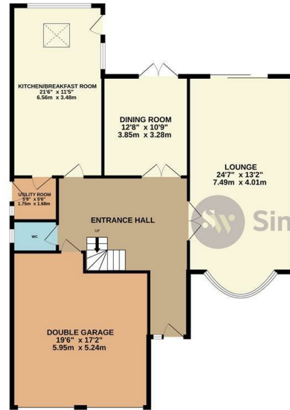
GROUND FLOOR 1321 sq.ft. (122.7 sq.m.) approx.