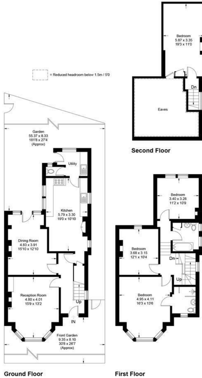
Illustration for identification purposes only, measurements are approximate, not to scale. Fourlabs.co © (ID1281569)