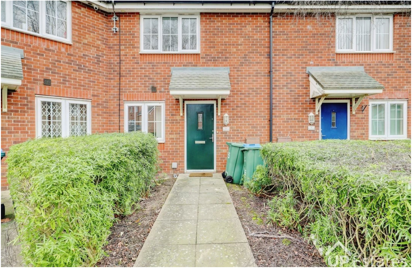
Cossington Road, Coventry