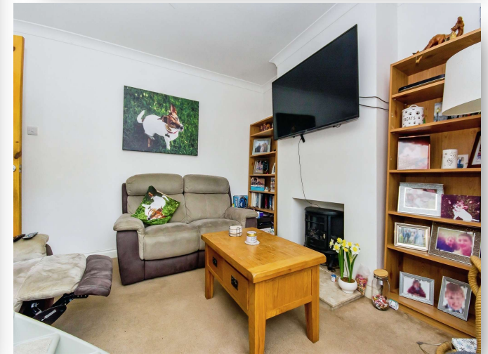
North Parade, Sleaford NG34 8AN