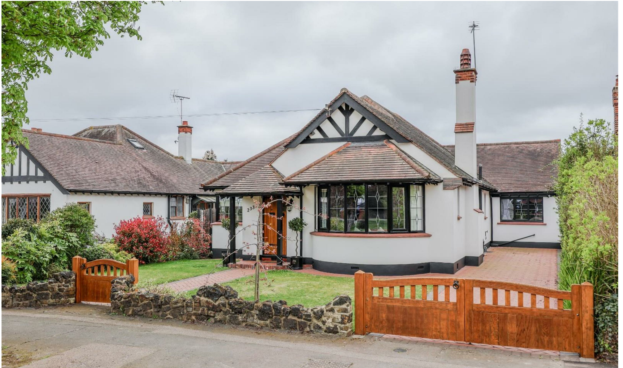
Thorpe Hall Avenue, Thorpe Bay £750,000