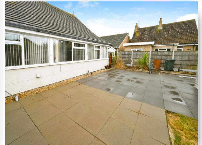
Church Lane, Skegness PE25 1ED