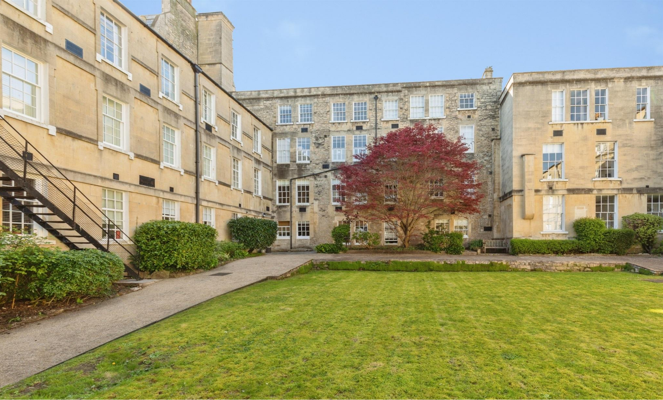
Ladymead House Walcot Street, Bath BA1 5BQ