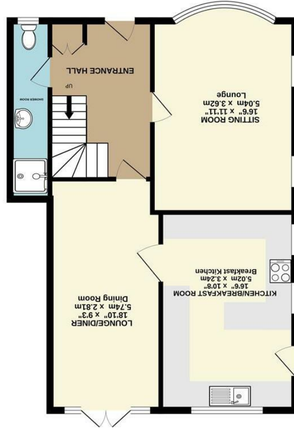
GROUND FLOOR 686 sq.ft. (63.7 sq.m.) approx.