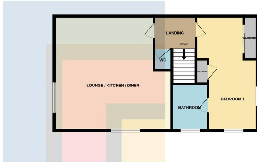
TOTAL FLOOR AREA: 964 sq.ft. (89.5 sq.m.) approx.

Whilst every attempt has been made to ensure the accuracy of the floorplan contained here, measurements of doors, windows, rooms and any other items are approximate and no responsibility is taken for any error, omission or mis-statement. This plan is for illustrative purposes only and should be used as such by any prospective purchaser. The services, systems and appliances shown have not been tested and no guarantee as to their operability or efficiency can be given. Made with Metroplan v2025.