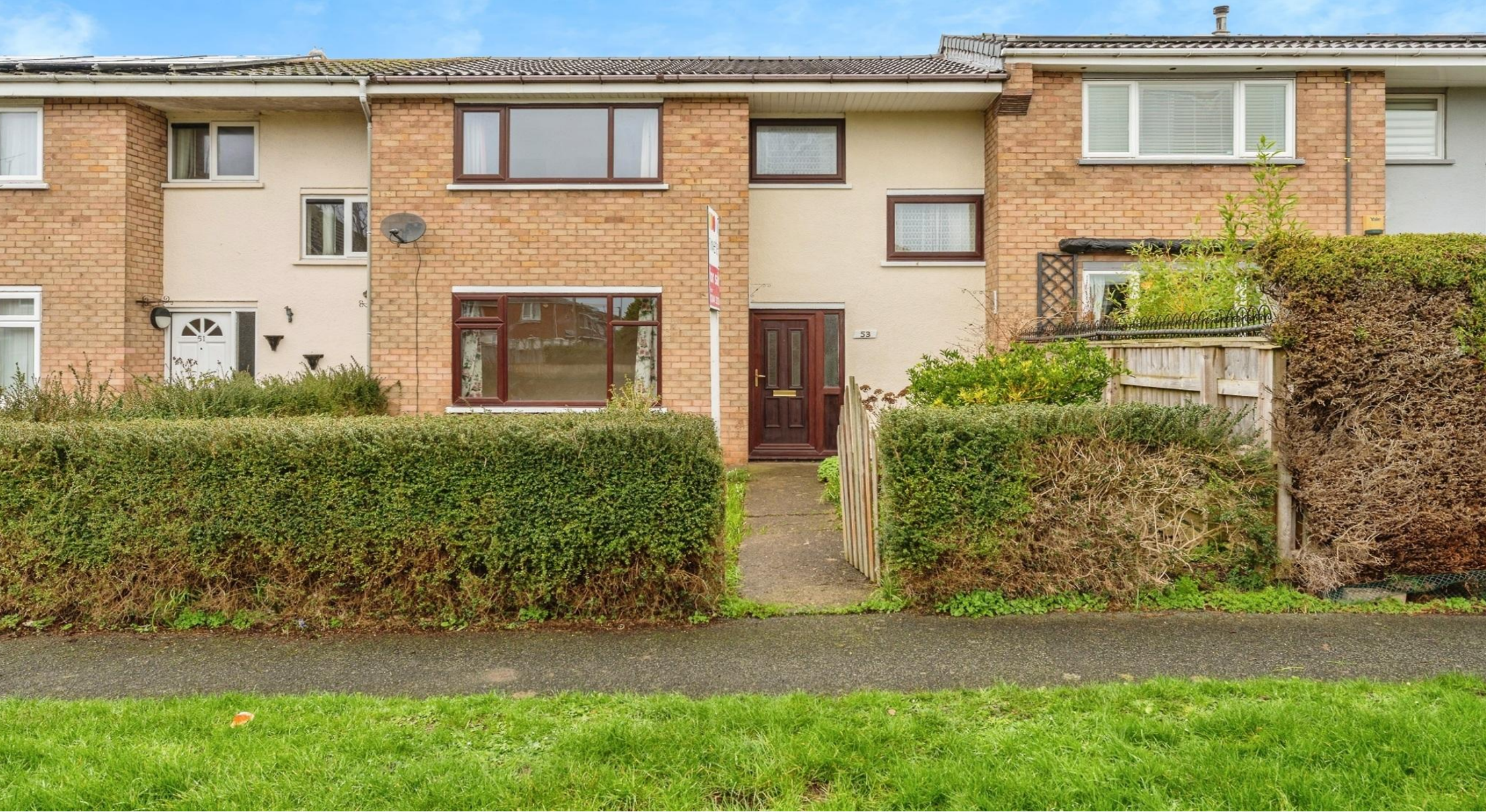
Melbourne Road, Blacon Chester CH1 5JQ

Not for marketing purposes INTERNAL USE ONLY