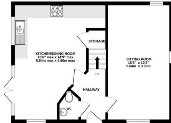
GROUND FLOOR 463 sq.ft. (43.0 sq.m.) approx.