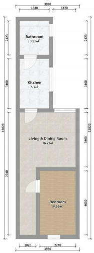
Milner Road Ground Floor