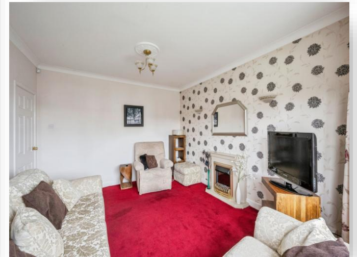
Rockingham Road, Swinton Mexborough S64 8ED