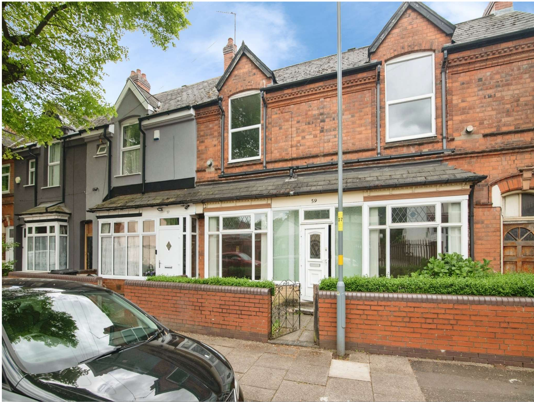
Hutton Road, Handsworth Birmingham B20 3RA