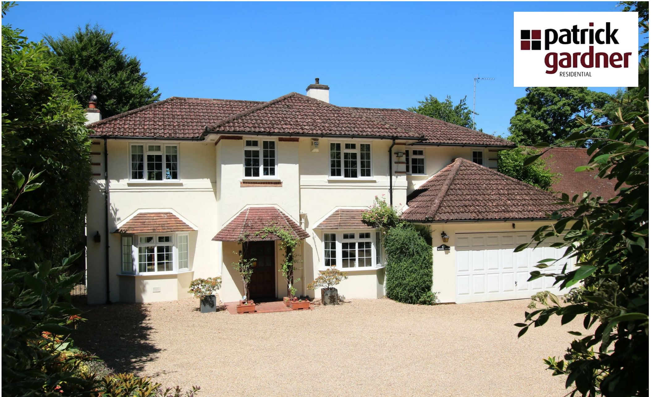
Woodlands, Guildford Road (Hawks Hill), Fetcham, Surrey KT22 9DP