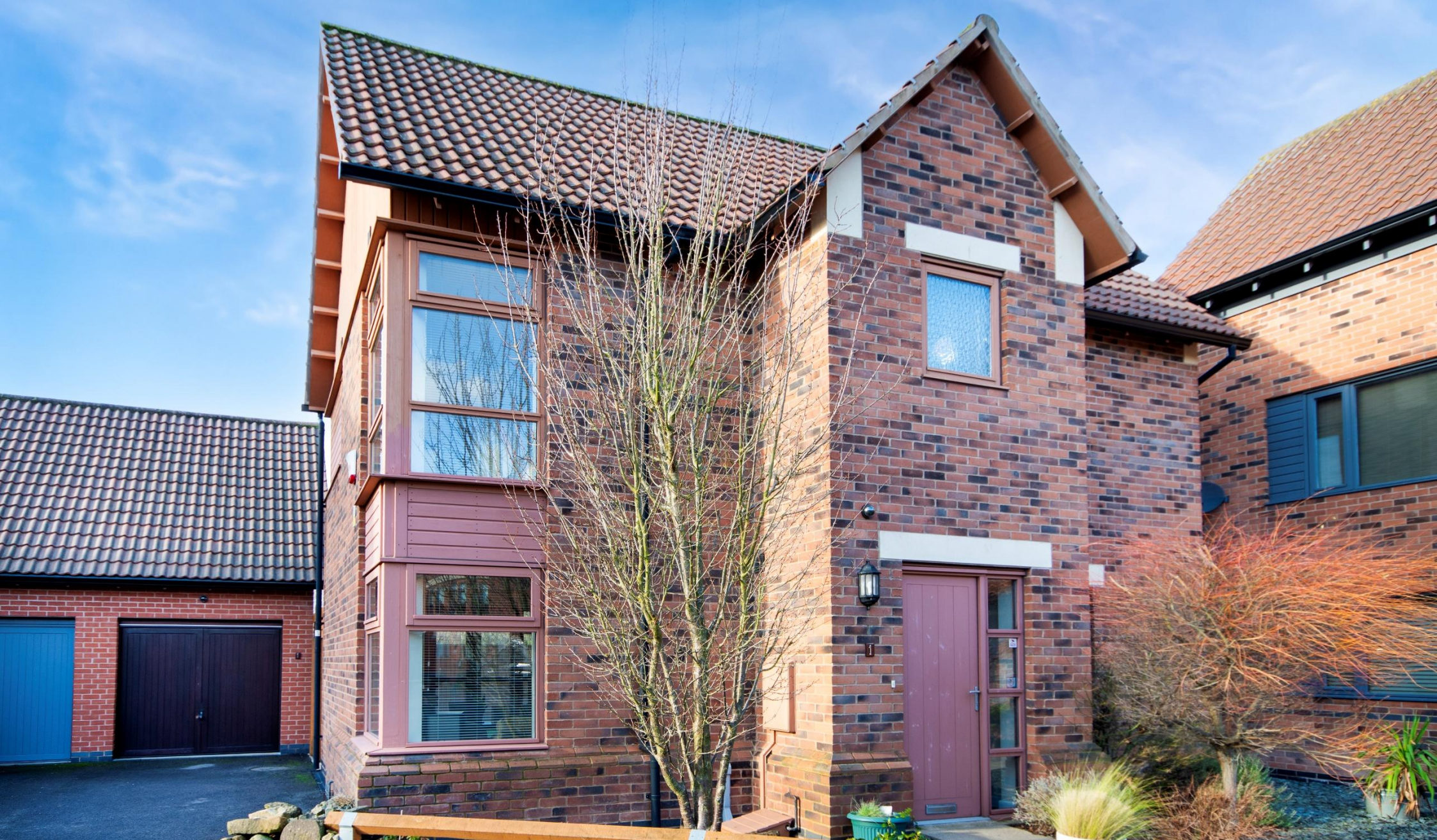
1 LAVENDER CLOSE, NEW OLLERTON £275,000