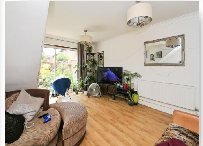
Mardale Gardens, Peterborough PE4 7GD