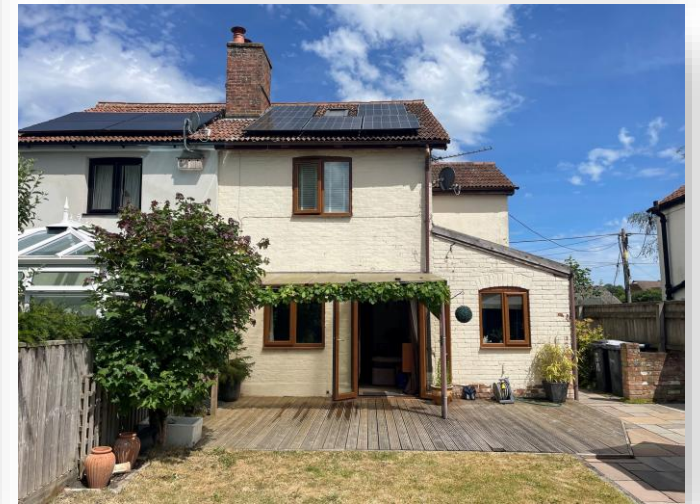
Silver Street, Potterne DEVIZES SN10 5NG