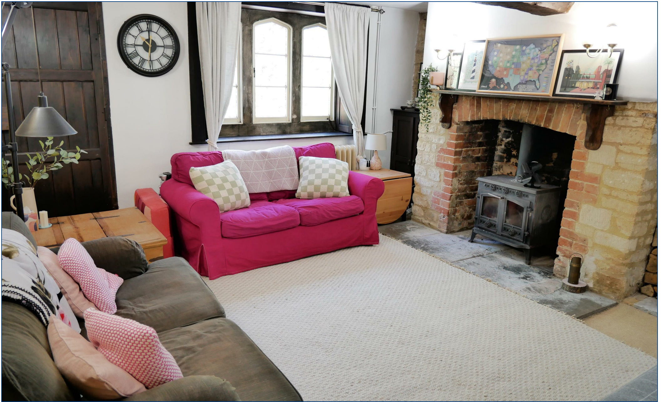
Curzon Street, Calne £265,000