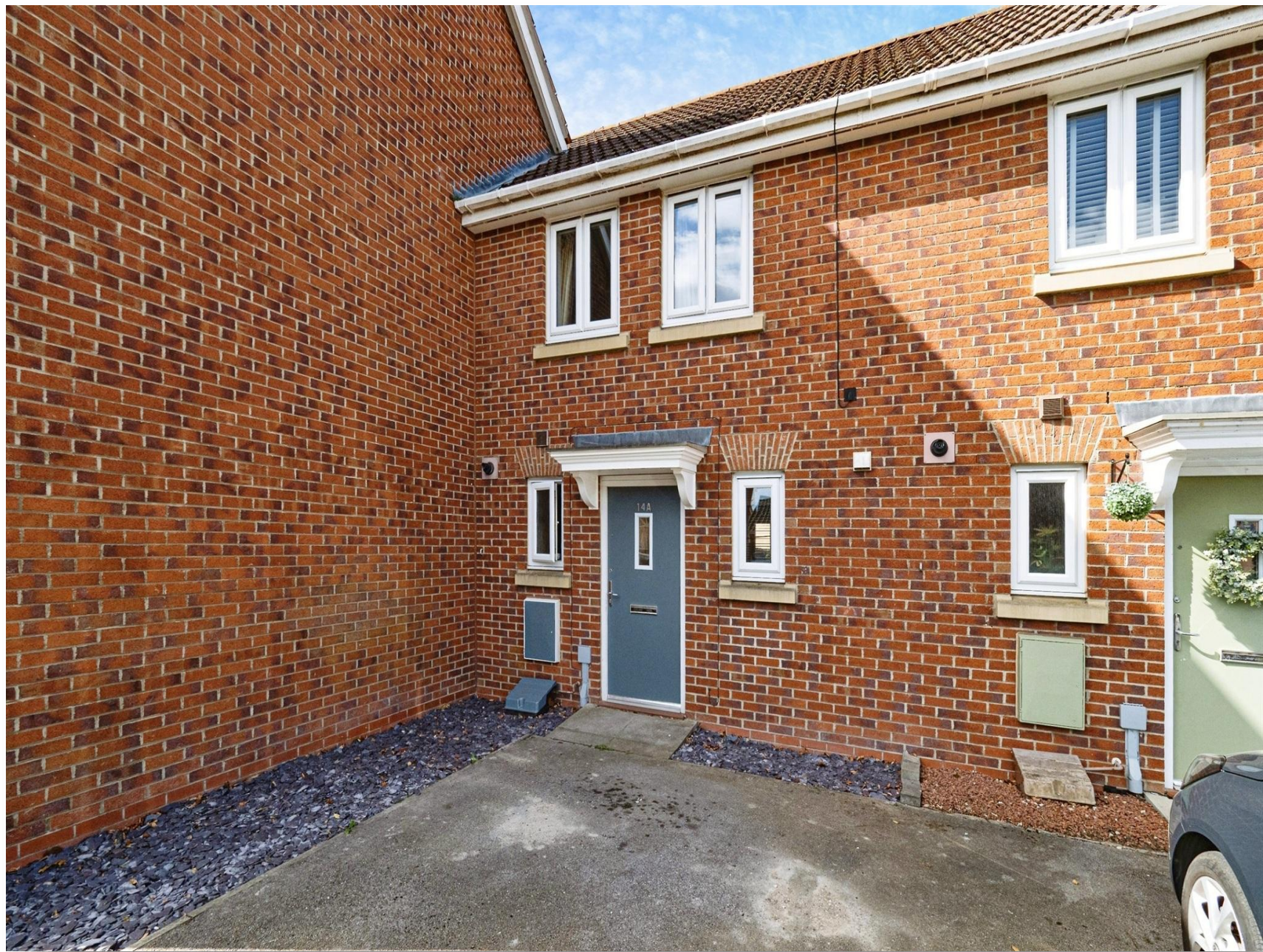
14a Woodheys Park, Kingswood, Hull HU7 3AJ